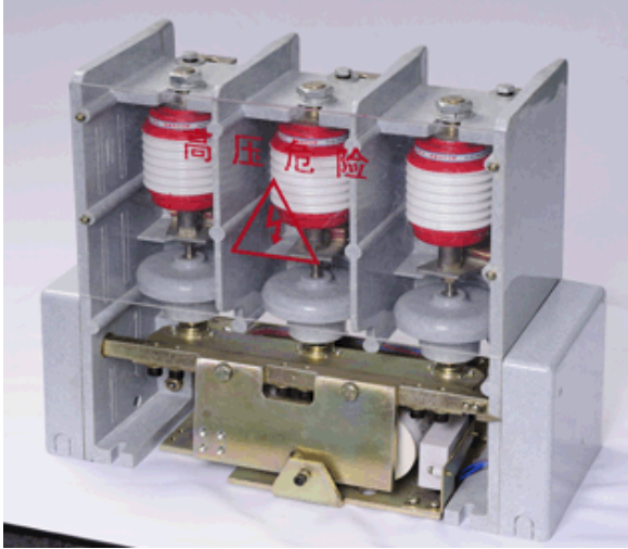
CKG4-250A/7.2kV-S AC Vacuum Contactor